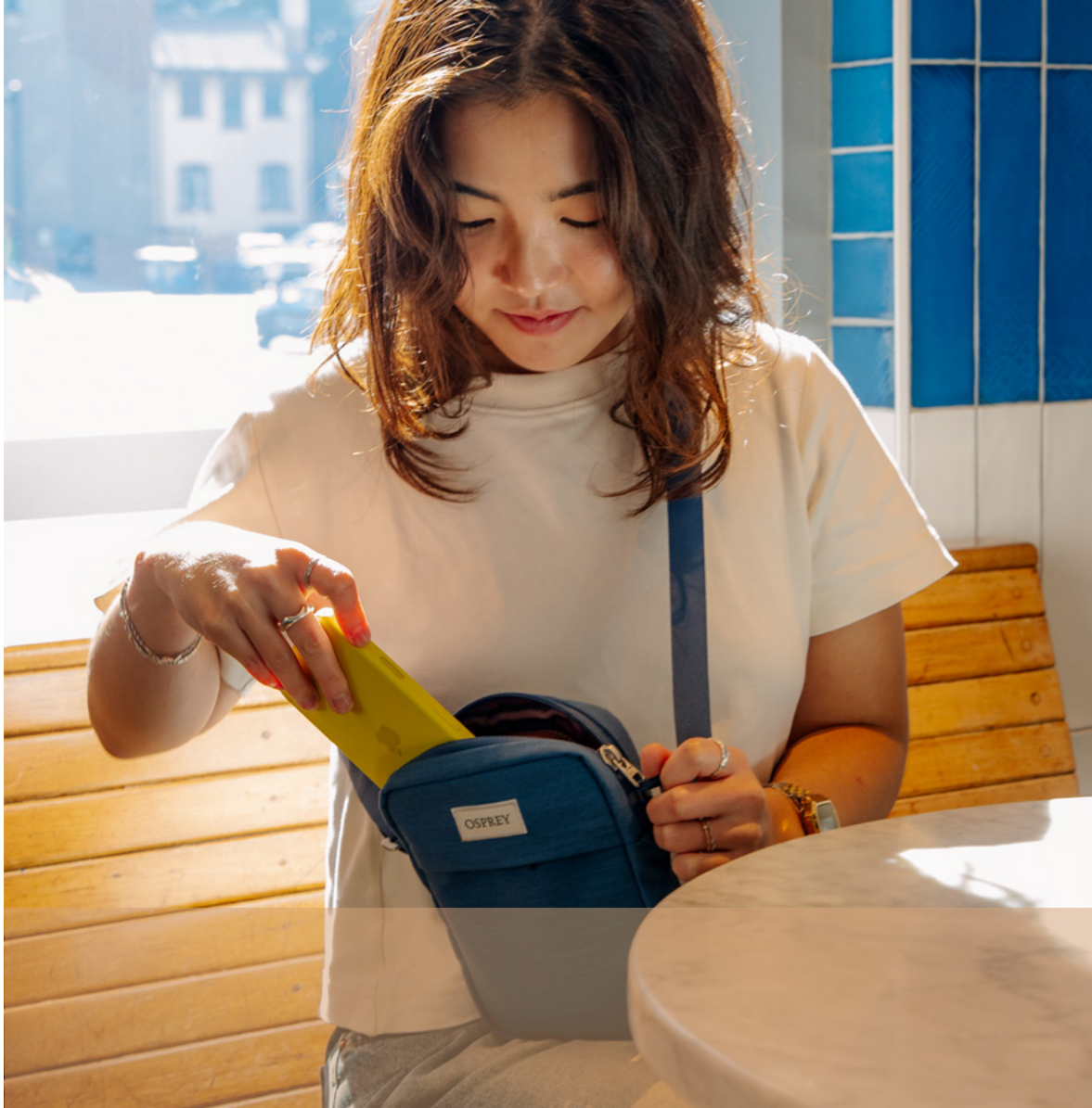
All products styles and colours subject to availability.

Our curated collection of premium merchandise is crafted with durability, design and purpose in mind. We believe that great products should do more than just look good. They should be made to last, with quality materials and timeless design that stand up to everyday use and reflect true value over time. Our product selection is built for longevity – the kind of merchandise people reach for often and use again and again.